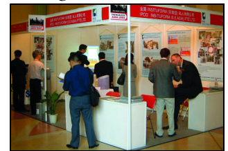
Insituform had a strong showing at the conference.