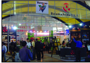
Balama Prima-Vermeer was one of many exhibitors.

TRENCHLESS ASIA 2004 provided a timely focus for this modern technology in China and the centrally located Shanghai Exhibition Center provided an excellent venue for the impressive range of equipment and services that were displayed by 96 companies from 13 countries.